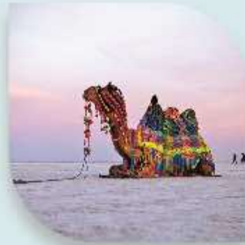
Rann of Kutch