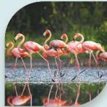
Nalsarovar Bird Sanctuary