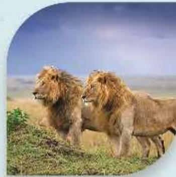
Gir National Park