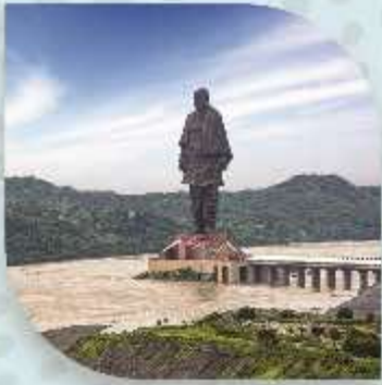
Statue of Unity