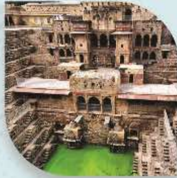
Rani ki Vav